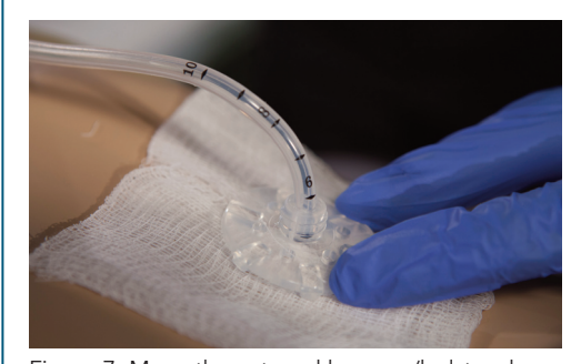
Figure 7. Move the external bumper/bolster down gastrostomy tube until a snug fit is achieved