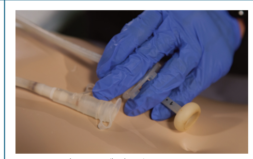
Figure 5. A bumper (bolster) type gastrostomy tube can be changed or removed at home using traction removal without local anesthesia, although some patients and specialists prefer changing this type of tube endoscopically.