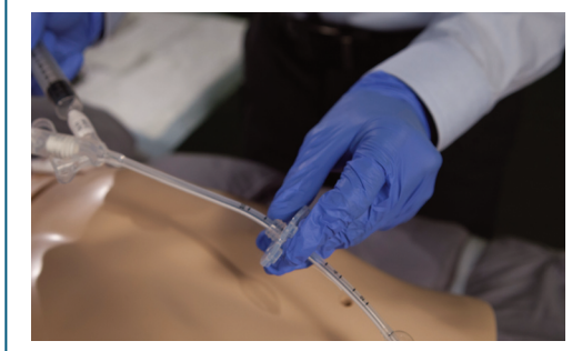
Figure 4. Move the external bumper 3-4 cm above the previously noted distance/markings of the old tube