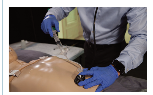
Figure 8. Verify gastrostomy tube position by using a syringe to flush air or water into the stomach and listening with a stethoscope